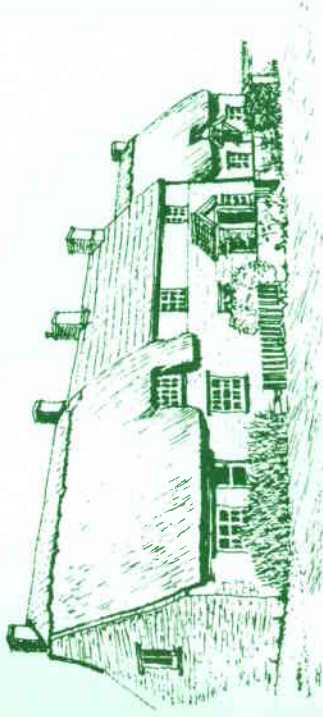
COTTAGES ON RADWELL GREEN

The single road through Radwell has a mixture of buildings from a converted chapel, cottages and farms to more modern dwellings.