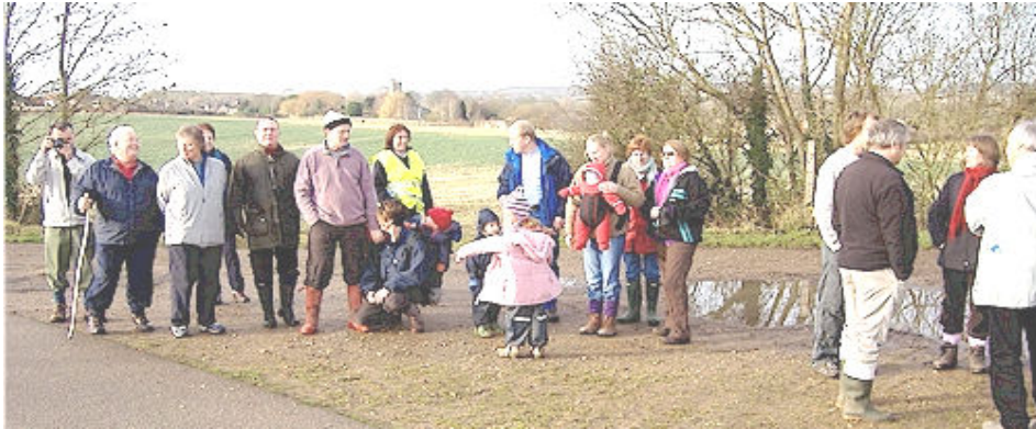
Photo: Annual Boxing Day Walk

I would like to extend an invitation to everyone to join us on our annual P3 Boxing Day walk and share in the festive spirit with your friends and neighbours whilst at the same time walking off those extra pounds! We meet at Felmersham bus shelter on Monday 26 December at 11.00am.