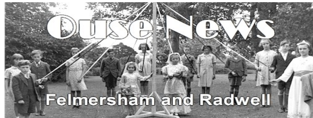
Felmersham and Radwell children about to start a Maypole dance, 1942