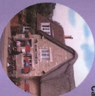
The Swan Inn Radwell