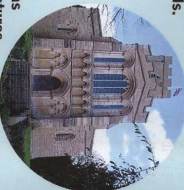
St. Mary's West Front

At the centre of Felmersham is the 13th century St. Mary's church with a very fine West Front and lofty interior. The original Early English style has been enhanced by features from other periods, the 15th century oak screen and the recent Millenium window add to the history of the building.