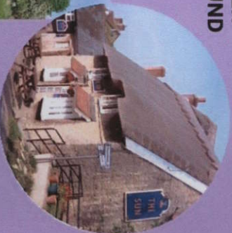
The Sun PH Grange Road

You can also use the map on the reverse to make up your own route, perhaps visiting the Nature Reserve. A walk along the river bank, heading east from Felmersham bridge, leads to Pinchmill Islands. A short distance along