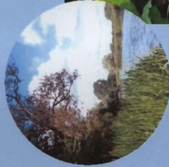
River Ouse to west

There is much more for the keen observer, particularly in the nature reserve to the north of Felmersham bridge.