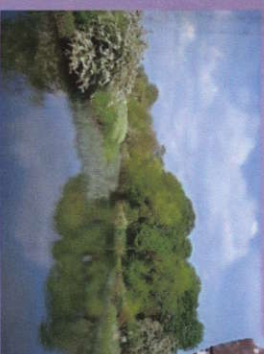
River Ouse to east

Next to Felmersham bridge is the Jubilee Garden, a grassed area where visitors can sit and enjoy the river and watch boats and canoes being launched from the slipway. This is a good point to start your walks in the area. There are two leaflets available in some local shops, pubs and churches, a THREE CHURCHES WALK and FOOTPATHS AROUND FELMERSHAM AND RADWELL.